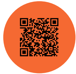
Register here by 17 April 2026